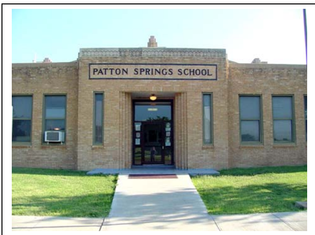
Patton Springs School, 1933